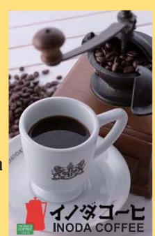
イノダゴーヒ INODA COFFEE